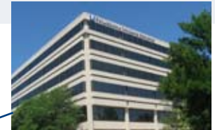
Corporate Headquarters Bala Cynwyd, Pennsylvania